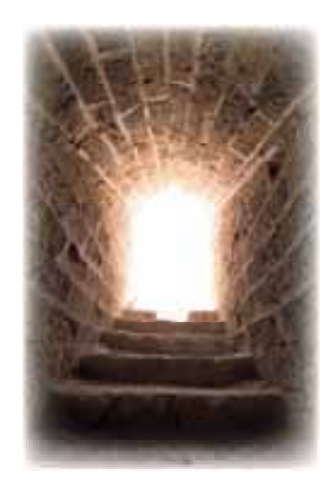
This guide has been produced by Marriage Care, a national charity whose aim is to support marriage at all stages of its development.

Marriage Care Clitherow House 1 Blythe Mews Blythe Road London W14 0NW